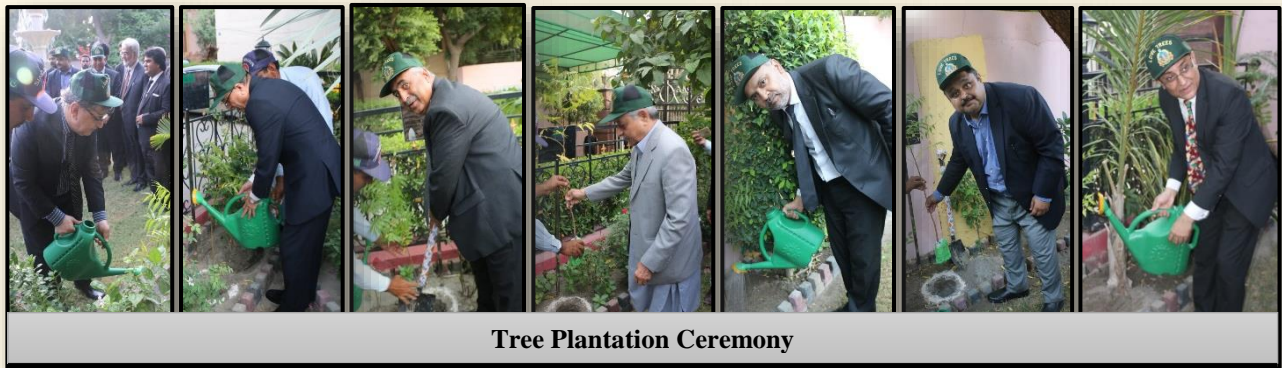
Tree Plantation Ceremony