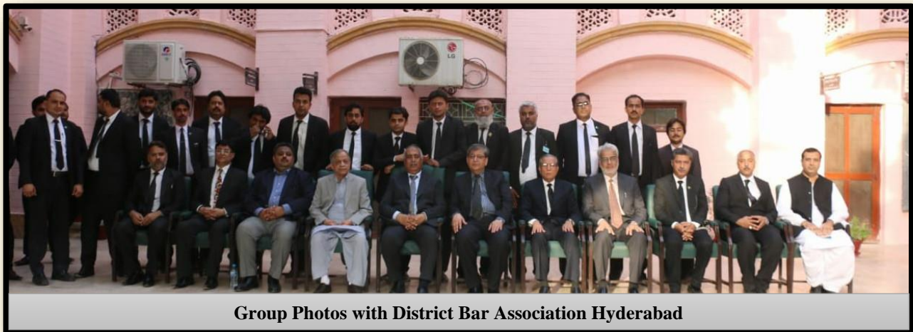
Group Photos with District Bar Association Hyderabad