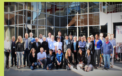
Intensive International Humanitarian Law Course, Switzerland