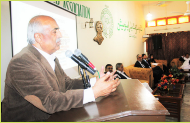
Two-day advocacy skill program, Thatta