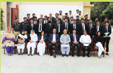
Police Prosecutors Training Program