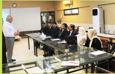
Training on Mediation for Sr. Civil Judges