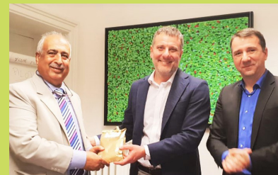
Mediation Training at ADR Center Rome, Italy