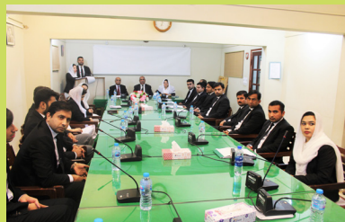
Exposure Visit of SJA Civil Judges from Punjab