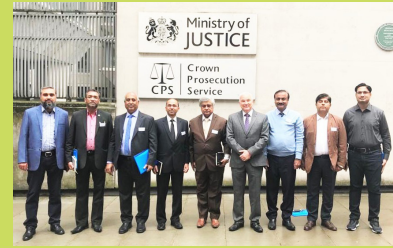
Visit of United Kingdom