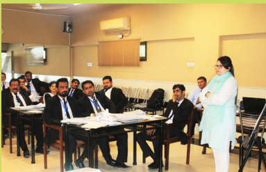
Training of Mediators/ Saalis