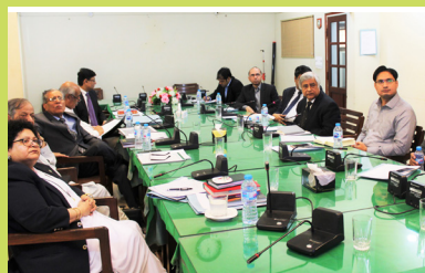
Judiciary Committee on Sindh Rule of Law Roadmap, 7th Meeting