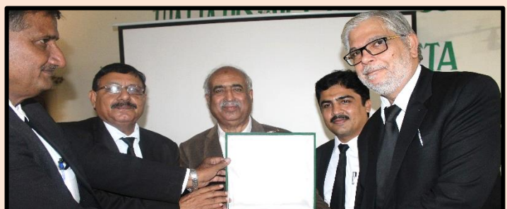
Director General gave ‘Shield of honor’ to the Hon’ble Chief Guest and to District Bar Association, Thatta