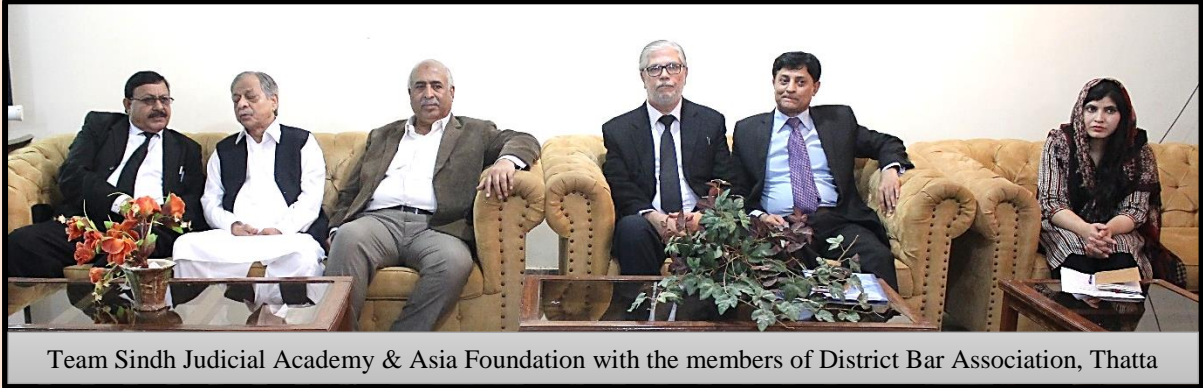
Team Sindh Judicial Academy & Asia Foundation with the members of District Bar Association, Thatta

Sindh Judicial Academy in collaboration with The Asia Foundation and Thatta District Bar Association arranged a one-day training program for the members of Bar on