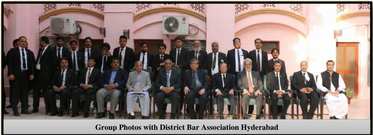
Group Photos with District Bar Association Hyderabad