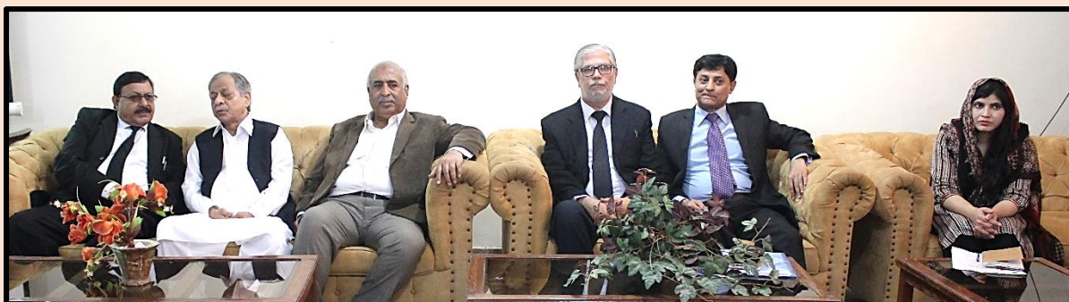
Team Sindh Judicial Academy & Asia Foundation with the members of District Bar Association, Thatta

Sindh Judicial Academy in collaboration with The Asia Foundation and Thatta District Bar Association arranged a one-day training program for the members of Bar on