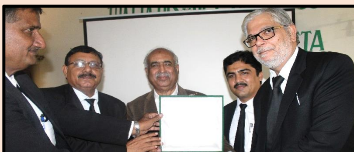
Director General gave ‘Shield of honor’ to the Hon’ble Chief Guest and to District Bar Association, Thatta