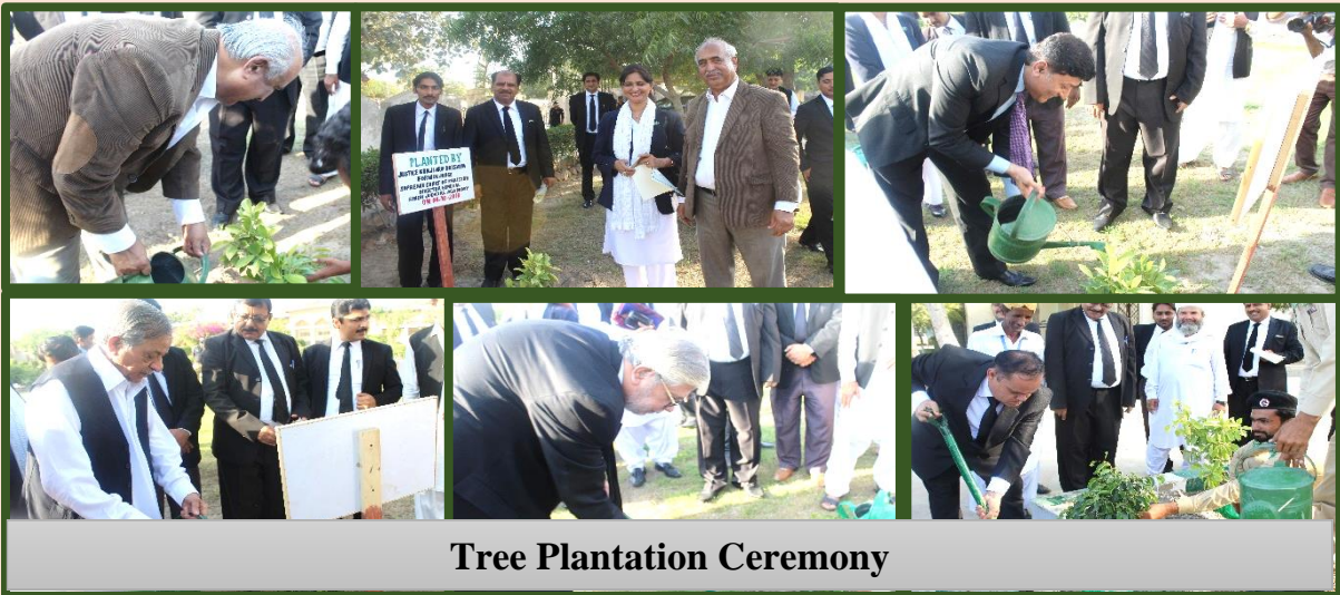
Tree Plantation Ceremony